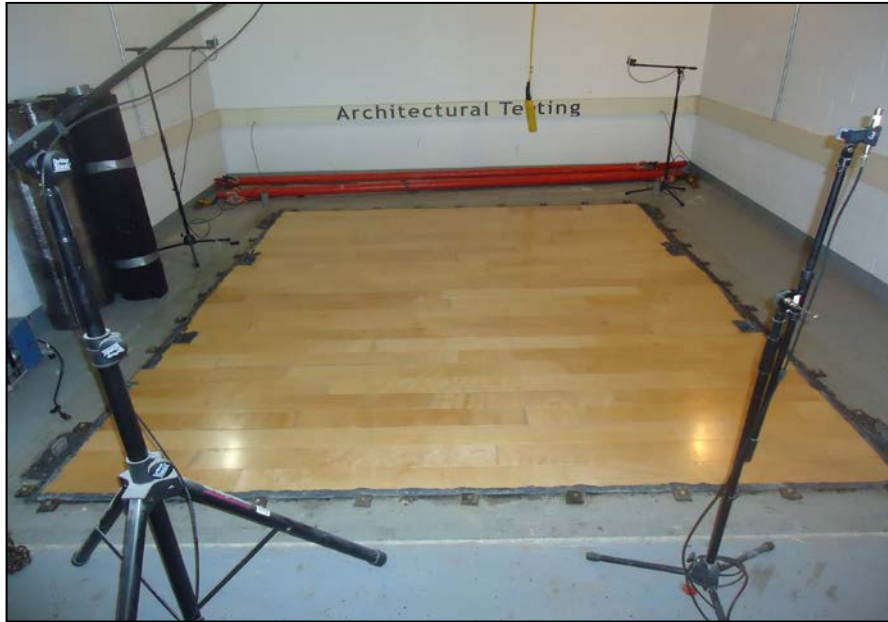
Source Room View of Test Specimen Installation