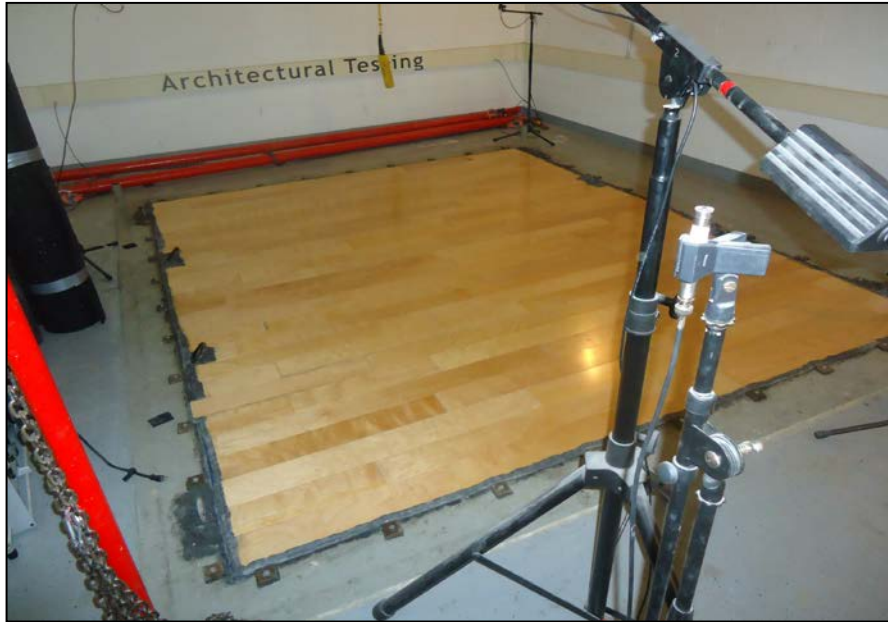
Source Room View of Test Specimen Installation