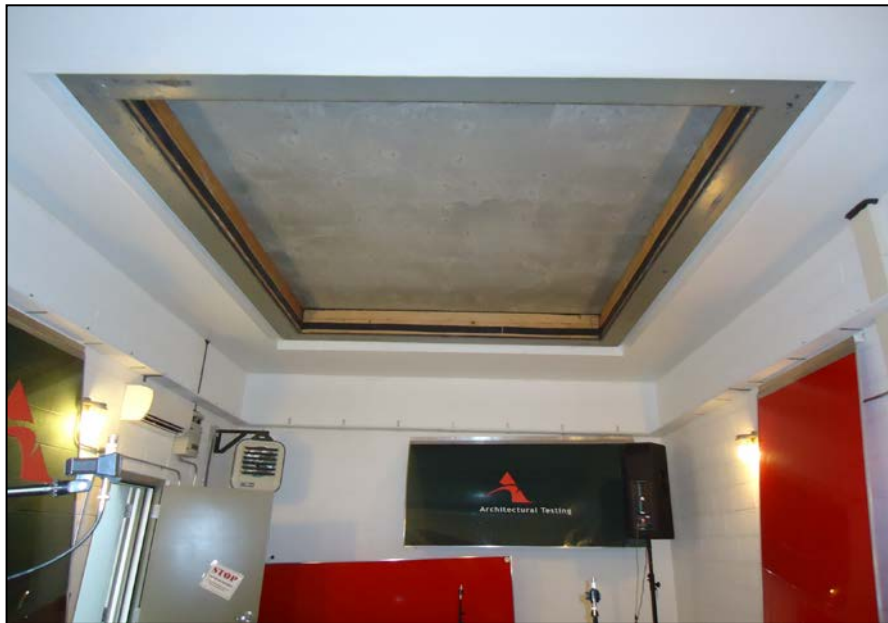
Receive Room View of Test Specimen Installation