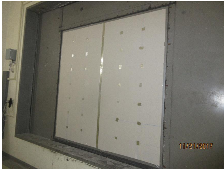
Photo No. 1 Receive Room View of Installed Test Specimen