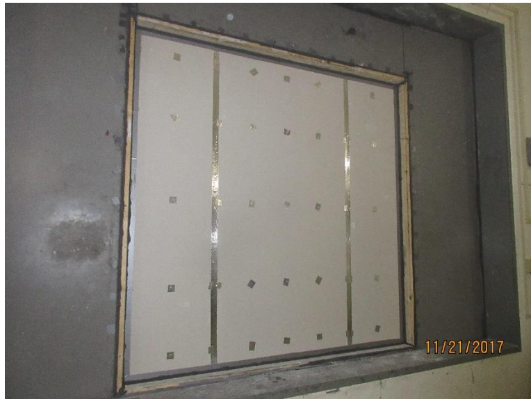
Photo No. 2 Source Room View of Installed Test Specimen